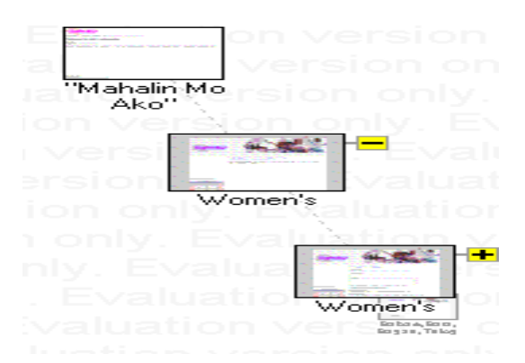
Figure 1 . A mapped out internal link of the video "Mahalin Mo Ako" (Love Me) which was uploaded to YouTube and linked to http://gabrielawomensparty.org/node/88/print. The video is a public service announcement about women's rights.

The party's website has more than 600 pages and was mapped using a sitemapper (see Figure 2). Analyzing the map, it is quite evident that the party focused mostly on linking to their own content (internal linking) and did not link to any external organizations. Even when they posted promotional videos on YouTube , the party resorted to embedding the videos into their website rather than outlinking to YouTube (Figure 1).